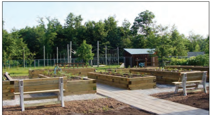
The new raised vegetable garden is a beautiful place early in the morning.

Improving the garden is important because it gives NTEC program participants, regard-